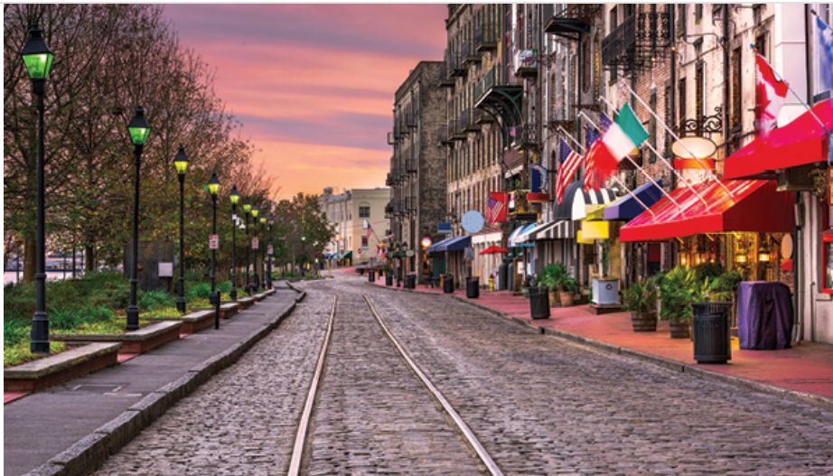
A walking tour is a charming way to get acquainted with Savannah, Ga.

The charming city of Savannah, along Georgia's coast, is home to one of the country's largest National Historic Landmark Districts, so a walking tour is a great way to get acquainted with the city and its history. A fun alternative is to take one of the many ghost tours available, since the city is said to be America's most haunted.