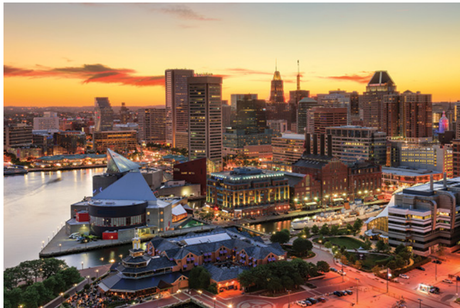
Baltimore’s Inner Harbor is home to many sites, including the National Aquarium.

areas, where any number of activities can occupy visitors for days on end. The wonderful – and free – museums of the Smithsonian Institution should be on every visitor’s agenda. Baltimore’s Inner Harbor, where you’ll find the National Aquarium, the USS Constellation and the Maryland Science Center, is also a must.